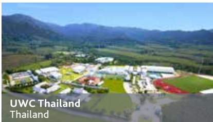
UWC Thailand Thailand