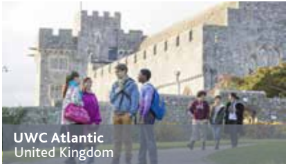
UWC Atlantic United Kingdom