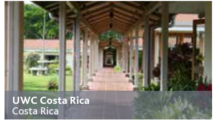
UWC Costa Rica Costa Rica