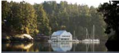
Pearson College UWC Canada