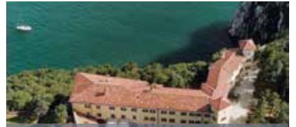
UWC Adriatic Italy