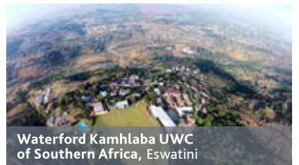
Waterford Kamhlaba UWC of Southern Africa, Eswatini

LEARN TO CHANGE THE WORLD. BE PART OF UWC.