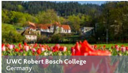
UWC Robert Bosch College Germany