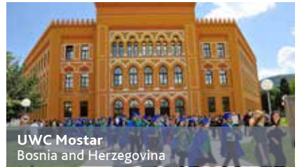
UWC Mostar Bosnia and Herzegovina