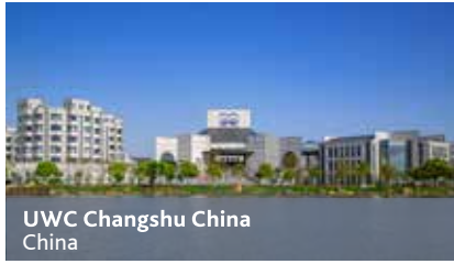
UWC Changshu China China