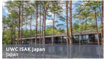
UWC ISAK Japan Japan