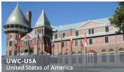
UWC-USA United States of America