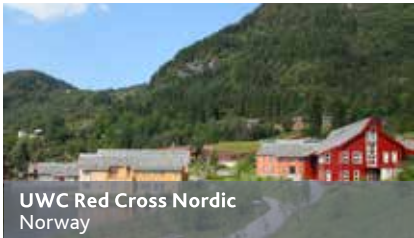
UWC Red Cross Nordic Norway