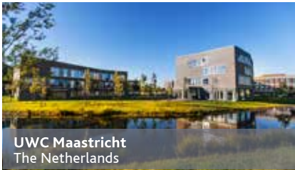
UWC Maastricht The Netherlands