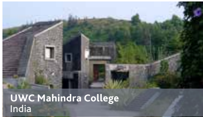
UWC Mahindra College India