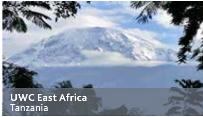
UWC East Africa Tanzania