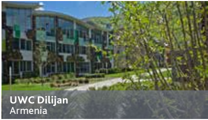
UWC Dilijan Armenia