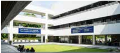
Li Po Chun United World College Hong Kong